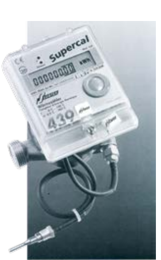
Compact heat meter Supercal 439