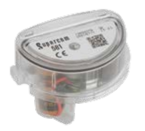
Add-on radio module Supercom 581