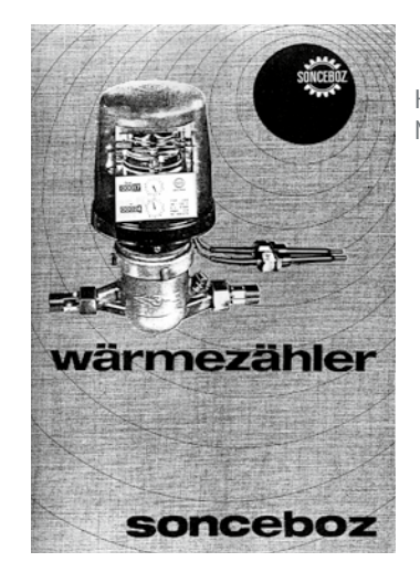
Heat meter Model 200

From mechanical to electronic systems, from manual to industrial production: the evolution of our products over 30 years.