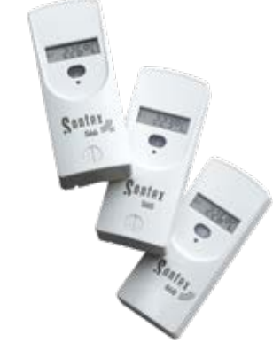
Electronic heat cost allocator Sontex 56x/868