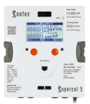
High-End integrator Supercal 5